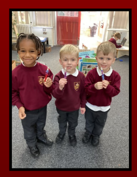
In our topic lessons we have been learning about our feelings.