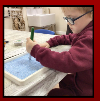
During our Literacy lessons we have been learning how to write our names. We have also started to learn some letter sounds.