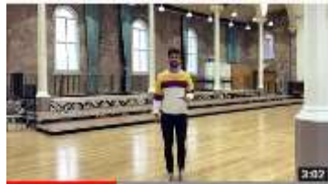
The Hallé - Midweek Challenge No.5

https://www.youtube.com/watch?v=jsQTBLZGv2s